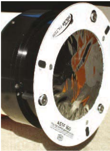
Image 1 - An example of the ASTF version of the Baader Solar Filter. Note the unique adjustable mounting system. The slight wrinkles in the AstroSolar film are indicative of proper, strain-free installation.

Most amateur astronomers are already familiar with the patented AstroSolar film sheets introduced 15 years ago by the German company, Baader Planetarium. Despite its low price, this unique filter material retains the true optical quality of the telescope optics amazingly well.