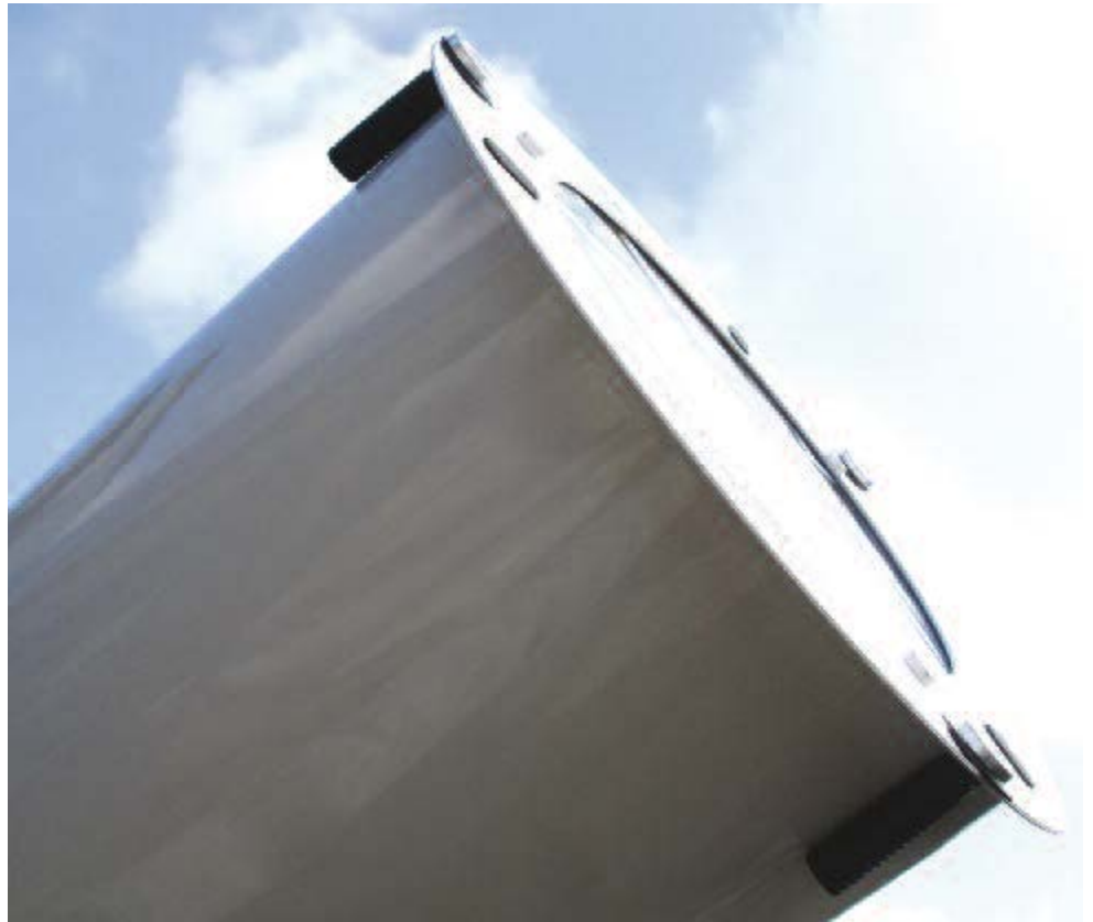
Image 4 - The BSF-ASTF version is shown with the mounting fingers gripping the outside of a dewshield. They can also be arranged to grip the inside of the shield for a cleaner appearance.

A new safety feature is noteworthy: The design incorporates three additional safety straps, each of which mounts onto the top end of a centering bolt and has a Velcro-style patch sewn onto its end. The counterpart then connects onto the telescope dew cap or outer tube with removable self-adhesive pads. On my 15X60 rubber-armored binoculars ( Image 3 ), the centering bolts alone give such a good fit, I felt I didn't need the adhesive pads. But this shows how serious Baader is about