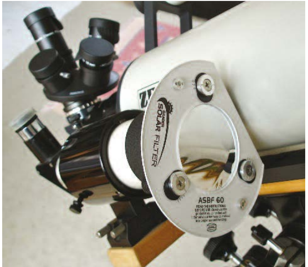
Image 2 - A BSF-ASBF cell is shown mounted on a finder scope. The frame cutoff accommodates the finder's proximity to the tube of its parent scope.

For the most part, this is not the case with many of the available Mylar-based films or thick, red darkroom films, nor most affordable single-side metalized float-glass filters. Baader's AstroSolar film