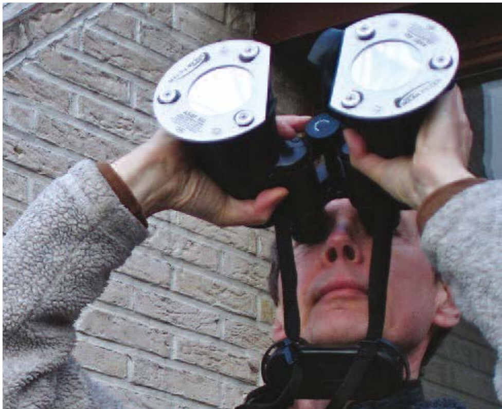
Image 3 - The author is shown using 15X60 binoculars fitted with twin BSF-ASBF 60 filter cells. The frame cutoffs allow ample clearance for even the narrowest interpupillary settings.

made by amateurs may look a little crude and are not very well secured to the telescope, thus at risk of being blown away by gusts of wind. You can imagine the consequences. Finally, some DIY cells look ugly on some superbly crafted telescopes. OK, it's only esthetics, but why not make all accessories good looking? The new BSF AstroSolar filters address all of these issues.